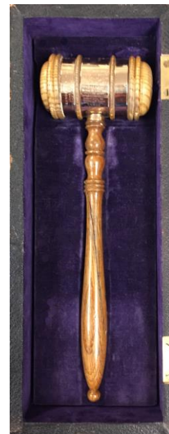
Click here to read about The Academy Gavel

The HRC has identified 434 Academy fellows in the historical roster and 2,655 essayists on annual programs since 1918. Thirty Honorary Fellows have been recognized in advancing the Academy's mission and goals. The Academy has now grown to 152 fellows, the majority of whom have contributed to the centennial celebration by submitting the essentials of past events or memoirs that highlight historical accomplishments by standing on the shoulders of giants . Our rich heritage will continue during the 100 th Annual Session with fellow interviews and photo sessions, along with fellowship and scholarly activities, all of which will be recorded for the Centennial History of the AP – 100 years of Fellowship and Scholarship. ■